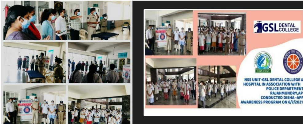
DISHA AWARENESS CAMPAIGN (WOMEN SAFETY)

1.3.1 The institution integrates cross-cutting issues relevant to gender, environment and sustainability, human values, health determinants, right to health and emerging demographic issues and professional ethics into the curriculum as prescribed by the University/respective regulative councils.