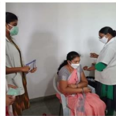
EACH ONE REACH ONE – COVID AWARENESS