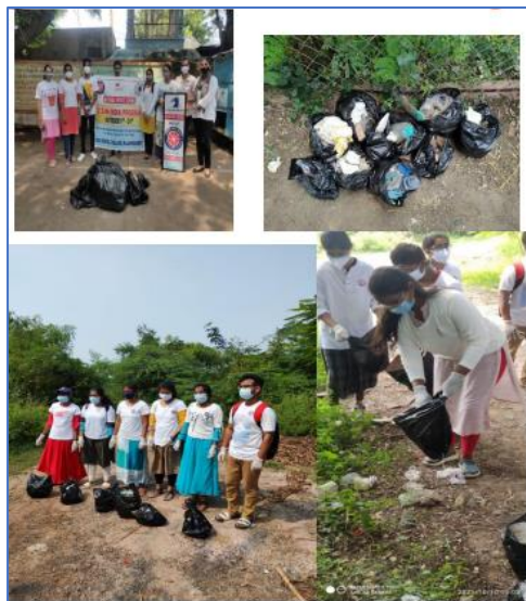
CLEAN INDIA PROGRAM