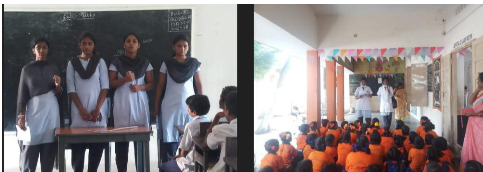
RIGHT TO HEALTH